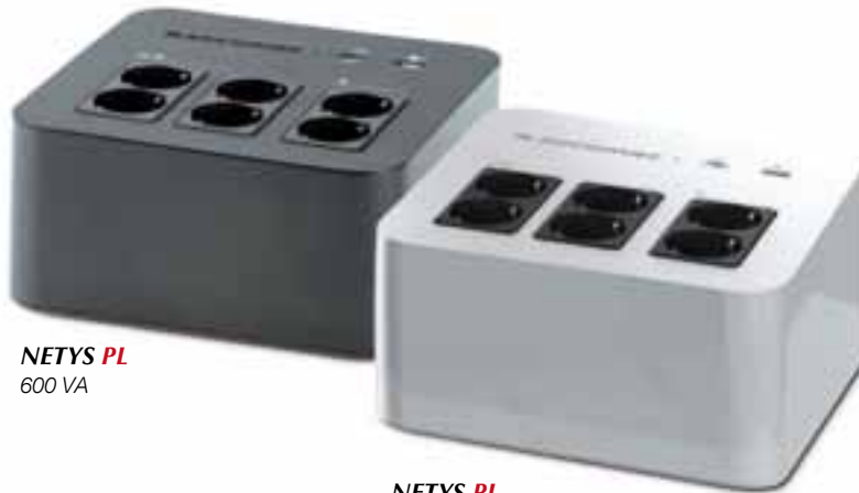
NETYS PL 600 VA